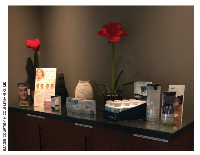
Figure 1. Consider offering and displaying the items you trust and recommend in your office.

eye. Also, you must stay current on new modalities and therapies to continue to provide your patients optimal help. I recommend you: